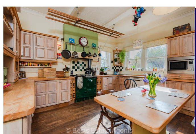
Offers in the Region Of £375,000

Independent Family Owned Estate Agents T: 01928 576368 E: Terry@bests.co.uk www.bests.co.uk