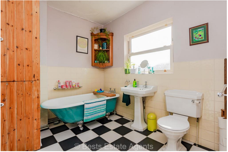
Thinking Of Selling Your Property? No Sale No Fee - Call Now.